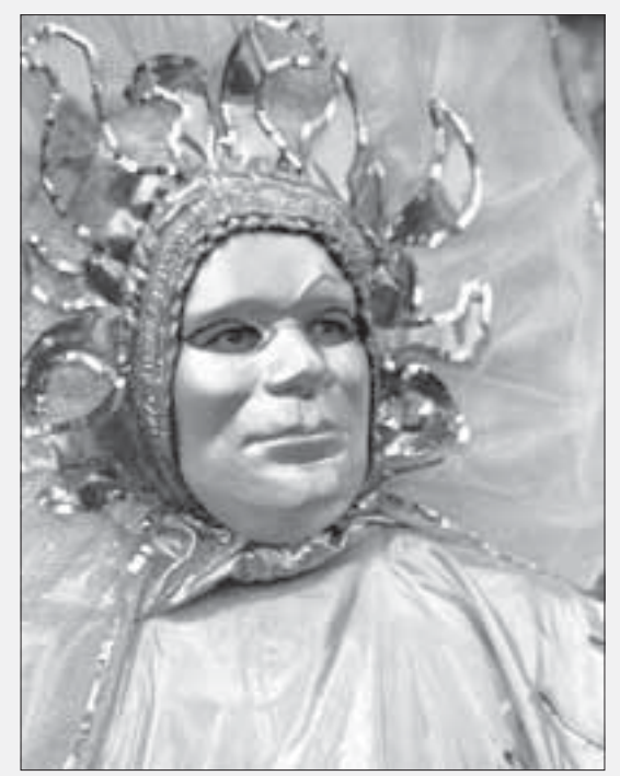
Carnevale is filled with elaborate costumes often parading through the crowds of onlookers.