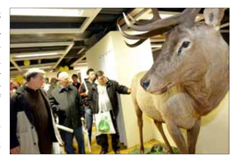
Hunting and fishing show will be held in vicenza Feb. 21-23.

Antique Market, Feb. 22, Piazzola sul Brenta, (PD), Villa